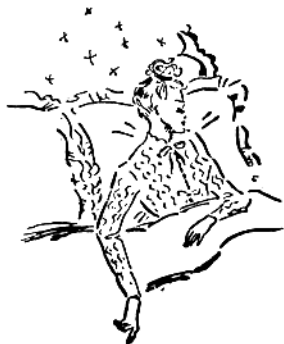
Dainty bed-jacket—with long sleeves or short

ONLY 5 ozs. of 2-ply wool are needed to make this coat—or 4 ozs. if you choose short sleeves; 2 No. 10 knitting needles are also required. Measurements